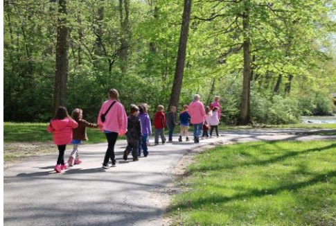
Students & Staff enjoyed the scenery while walking at Tawawa Park