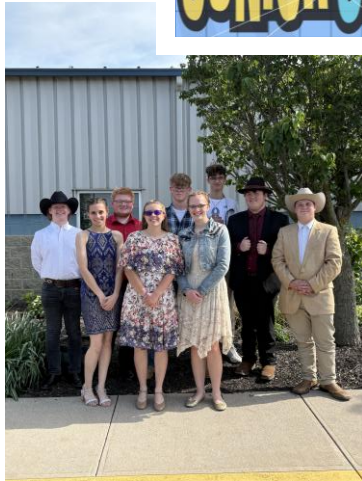
Juniors & Seniors Enjoyed Their Night Out on Saturday, May 10 th at Los Pitayos and Laser Web.