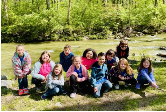
The 2 nd graders enjoyed the Praise Walk on Friday, May 9 th