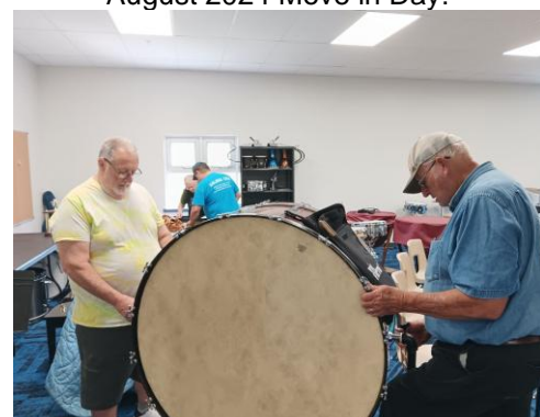
August 2024 Move in Day!