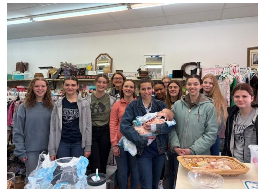
Right to Life Outreach

"Each one should use whatever gift he has received to serve others, faithfully administering God's grace in its various forms." 1 Peter 4:10