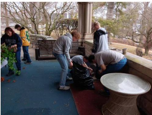
Greatstone Castle Outreach