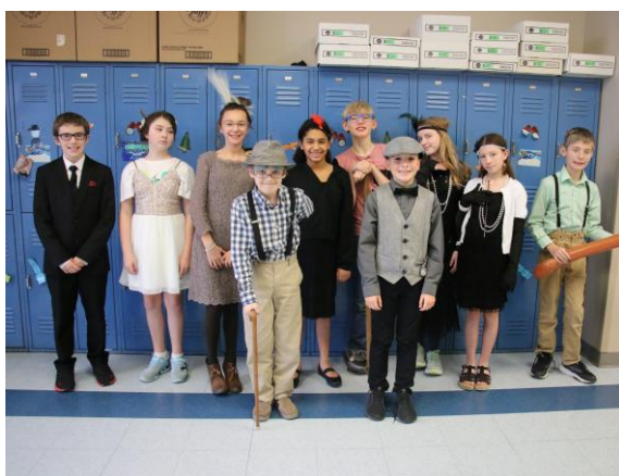
Our awesome students enjoyed dressing up for the 100 days of school.