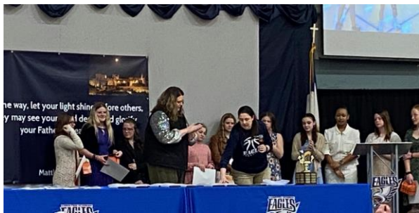
Junior High Girls being recognized for an outstanding year.