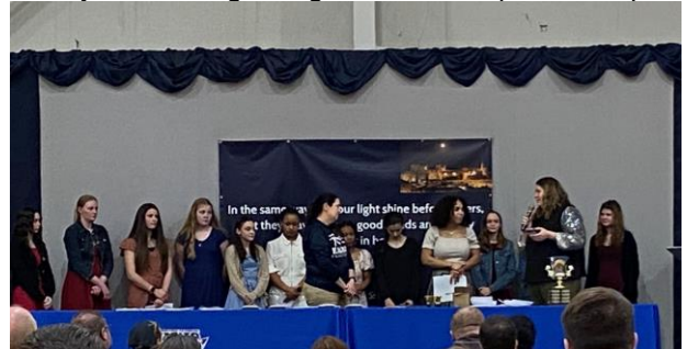
Varsity Girls being recognized at the sports banquet.