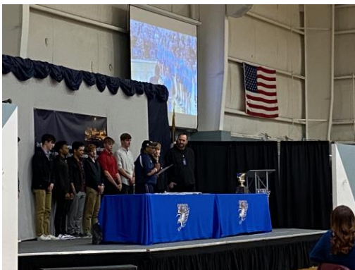
Coaches sharing how proud they are of the boys' basketball team.