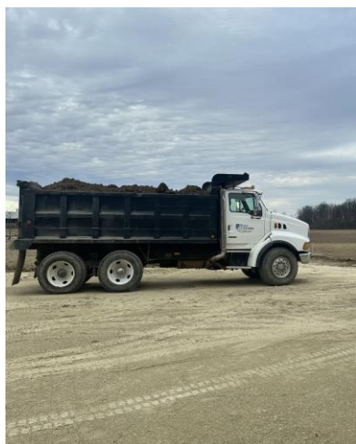
Dirt for the Footer arrived yesterday (February 15)

What are you facing? Is it something that seems bigger than what you can do on your own? If so, know this, God is on your side. He is fighting for you, and helping you overcome. So be encouraged. God will help you win what you're up against. It's up to you to trust Him. And sometimes, that's the hard part. It's hard keeping encouraged and keeping in faith when it feels like all odds are against you. Today, know that you're not fighting alone. With the help of Jesus, you're making a huge difference in the plan of God here on earth. Copied from studentdevos.com