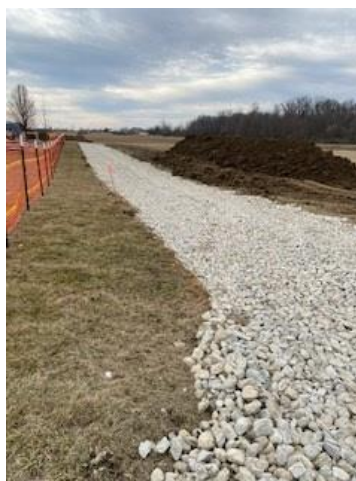
Gravel driveway going back to the work area