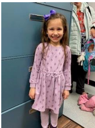
Arielle Blackford Kindergarten