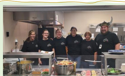
CAS "Kitchen Krew" Gearing up for the First Responders Luncheon.