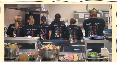
The "Kitchen Krew" wore new shirts in honor of our First Responders.