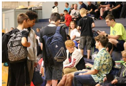
Middle School & High School students waiting to be dismissed to their homeroom.