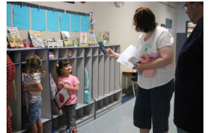
A kindergarten student is saying "good-bye" to her mom on her first day of school.