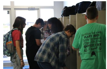
High School students catching up from their summer fun before going into their homeroom class.