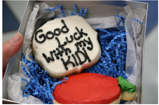
A CAS parent presented this awesome cookie to her child's teacher.