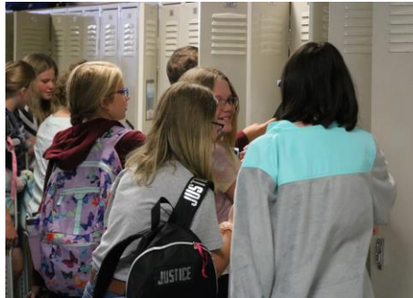
Middle School students putting their supplies in their lockers.