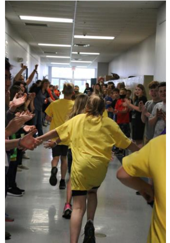
5 th Grade Clap Out!