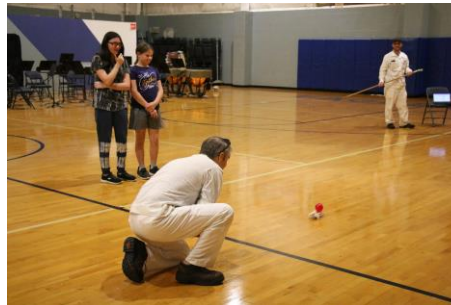
5 th Grade Enjoying their Honda Project!