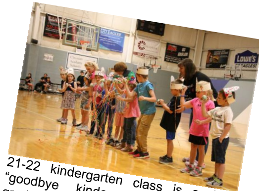
21-22 kindergarten class is saying "goodbye kindergarten, hello 1 st grade"!