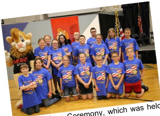
5 th grade Dare Ceremony, which was held on Thursday, May 19 th .