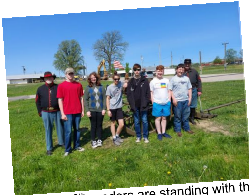
The CAS 8 th graders are standing with the artillery men at the Civil War Educational Day at the Fairgrounds which was held on Friday, May 13 th .