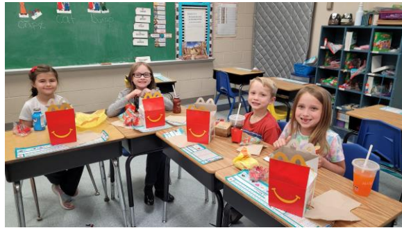
The students above had a celebration lunch from McDonalds for reading 5,000 minutes over the 21-22 school year. Congratulations!