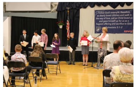
Middle School & High School Awards Ceremony