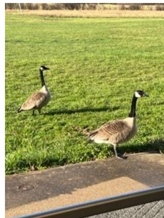
The geese are wanting in to visit the students of CAS