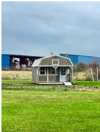
The geese have a new home in the CAS garden shed