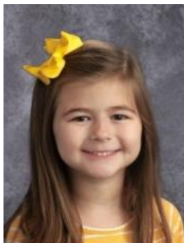
Lillian Yoh Kindergarten