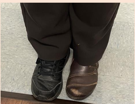
Oh no! Mismatched shoes. This happened when a teacher was in a hurry to teach her students.

When we leave God out of the equation of our success, that’s never a good thing. We should always be looking to God, asking His advice, and seeking His approval, rather than the approval and attention of others. It’s God’s help we should want to live out each day of our lives. When we include Him in our success and look to Him to bring us the belonging and attention we crave, that’s when we will be the most fulfilled. Copied from studentdevos.com