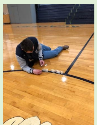
Science Fun “Keep Moving Forward”