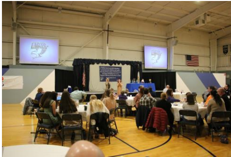
Winter Sports Banquet was held on Tuesday, March 1 st .