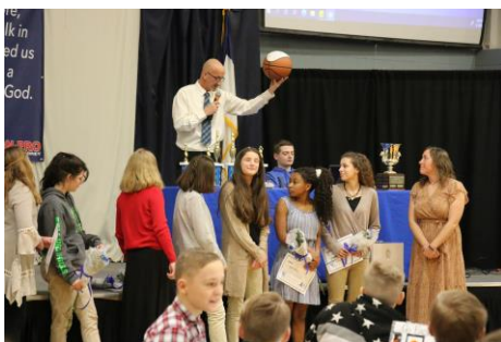
Junior High Girls Basketball Team