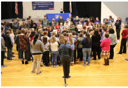
CAS staff & students gathered around the Junior High Girls basketball team before leaving to play in the championship game.