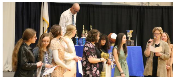
Varsity Girls Basketball Team