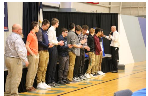
Varsity Boys Basketball Team