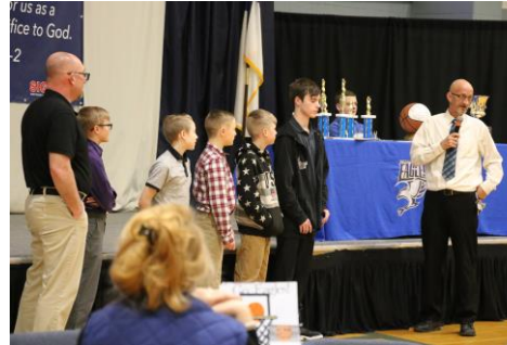
Junior High Boys Basketball Team