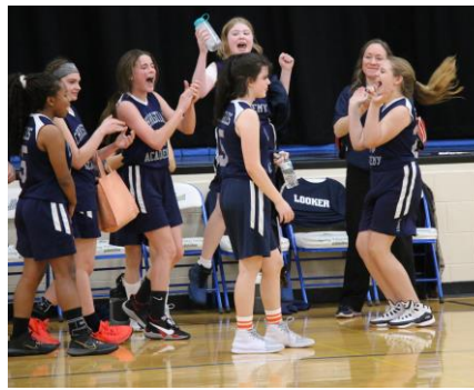
Junior High girls celebrating at the championship game.