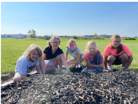
CAS Students are Enjoying Recess!