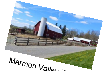
Marmon Valley Farm

Marmon Valley Farm, Zanesfield, Ohio Students Bring Own Lunch