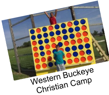
Western Buckeye Christian Camp

Western Buckeye Christian Camp Lunch Provided