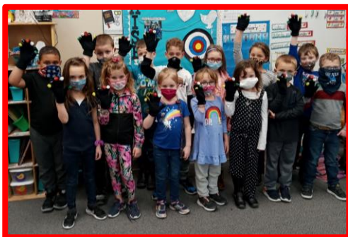
We are the Gospel Fuzzies with Good News for You and Me!