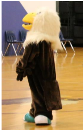
School Mascot Rah! Rah! Rah!