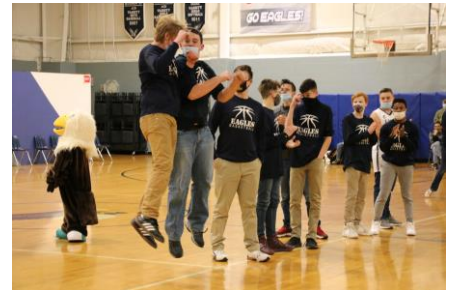
Homecoming Pep Rally on Friday, January 22nd