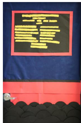
7 th & 8 th Grade