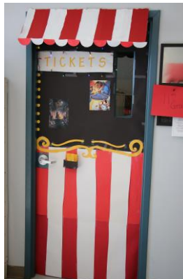
11 th Grade