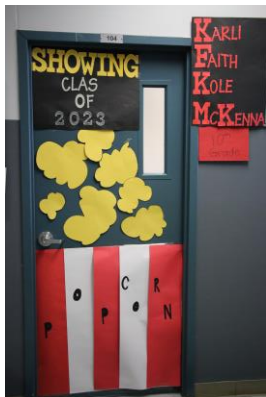
10 th Grade