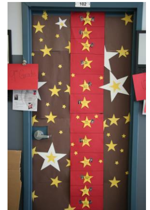
9 th Grade