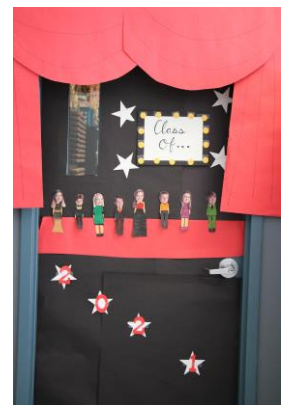
12 th Grade