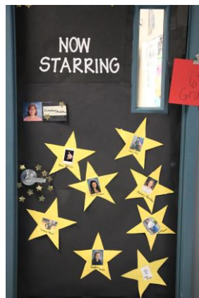
6 th Grade