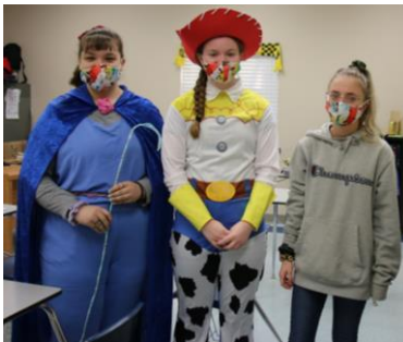
On Tuesday, January 19 th the middle school & high school students held a “Movie Dress Up” day. The 10 th graders were characters in “Toy Story”.

It’s easy to listen to the things in the world and let the world’s voice speak louder than God’s voice. However, if we determine to listen to what God says, focus on that voice, we can be at peace. So today, regardless of what is going on in your life, no matter what circumstances and situation you face, choose to listen to God’s Word. Make God’s Word your focus and you’ll find that your heart will be at peace. Listen to God’s Word, Not the World. Copied from: studentdevos.com