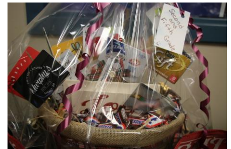
Merry Gift Card Basket 2 nd & 5 th Grade

Basket, Ornaments, $25 Walmart Gift Card, $15 Dairy Queen Gift Card, $25 Kroger Gift Card, $20 K&J's Ice Cream Gift Card, $25 Murphy's Gift Card, $25 Applebee's Gift Card, $25 Amazon Gift Card, $25 Kohl's Gift Card, $20 Subway Gift Card, $25 Chipotle's Gift Card, $20 Candyll Gift Card