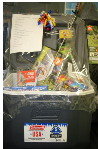
Outdoor Family Fun 6 th Grade

Box of Graham Crackers, Bag of Large Marshmallows, Hershey's Candy Bars, 4 Toaster Forks, Toffee Popcorn with Peanuts, Buttery Kettle Corn, Organic Cinnamon Sticks, Apple Cider, Hot Chocolate Mix, Pumpkin Spice Coffee Pods, Pioneer Woman Fall Decorated Paper Plates & Napkins, Harvest Tapestry Table Runner, Fall Decorated Plastic Table Cover, Fall Plastic Serving Platters/Trays/Neutralizing Room Spray, Scented Wax Cubes, Was Cubes, Small Candles, Relaxing Body Lotion, Small Round Tabletop Scarecrows, Thanksgiving Mantle Turkey with Dangling Legs, Gray Laundry Basket