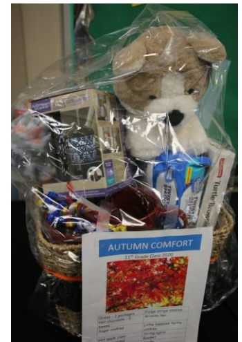
Autumn Comfort Basket 11 th Grade

$30 Amazon Gift Cards, $25 Bob Evans Gift Card, $20 Speedway Gift Card, $10 Chick-Fil-A Gift Card, Gummy Candy Corn, Noah's Ark Figurines.