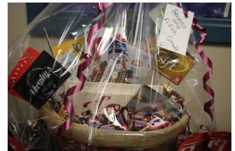
Merry Gift Card Basket 2 nd & 5 th Grade

Basket, Ornaments, $25 Walmart Gift Card, $15 Dairy Queen Gift Card, $25 Kroger Gift Card, $20 K&J's Ice Cream Gift Card, $25 Murphy's Gift Card, $25 Applebee's Gift Card, $25 Amazon Gift Card, $25 Kohl's Gift Card, $20 Subway Gift Card, $25 Chipotle's Gift Card, $20 Candyll Gift Card