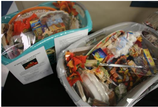
Fall in Love with Fall Basket 4 th grade

Box of Graham Crackers, Bag of Large Marshmallows, Hershey's Candy Bars, 4 Toaster Forks, Toffee Popcorn with Peanuts, Buttery Kettle Corn, Organic Cinnamon Sticks, Apple Cider, Hot Chocolate Mix, Pumpkin Spice Coffee Pods, Pioneer Woman Fall Decorated Paper Plates & Napkins, Harvest Tapestry Table Runner, Fall Decorated Plastic Table Cover, Fall Plastic Serving Platters/Trays/Neutralizing Room Spray, Scented Wax Cubes, Was Cubes, Small Candles, Relaxing Body Lotion, Small Round Tabletop Scarecrows, Thanksgiving Mantle Turkey with Dangling Legs, Gray Laundry Basket