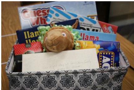
Parents Night Out 9 th Grade

Kindle Gift Card, 2 Throw Pillows, Fuzzy Blanket, Wax Burner, Scented Wax Melts, Salted Caramel Candle, Fuzzy Hat, 3 Board Games for the Family, Uno, Playing Cards, White Board and Markers, Popcorn, Hot Chocolate, Tea, Candy, Hand Sanitizer