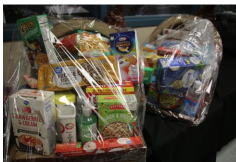
Cornucopia – Horn of Plenty Basket #1 3 rd Grade

Popcorn Machine, Popcorn Packs, Popcorn Variety Packs, Flavored Popcorn Seasonings, $20 Dominos Gift Card, 2-$15 Little Caesars Gift Cards, $10 Culver's Gift Card, 3 Veggie Tales Movies, 3 DVD's, 3 Blu-Ray & DVD's, Microwave Movie Theater Butter Popcorn, Lots of Snacks, Root beer & Sunkist, Kool-Aid, 23 Boxes of Movie Theater Candy.