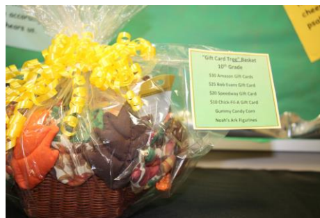
Gift Card Tree Basket 10 th Grade

For the Kids: Money for Dinner in, Sorry and Guess Who Games, Microwave Popcorn and Chocolate, Llama Llama Red Pajama & Llama Llama Holiday Drama books, Llama Llama Stuffed Animal