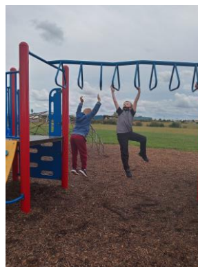
Mastery of the monkey bars is a definite kindergarten goal!