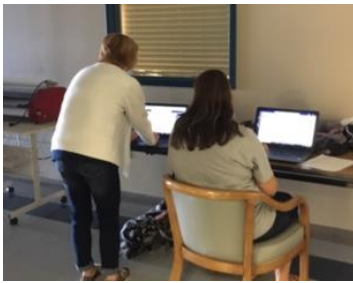
On Friday, September 25 th school was dismissed at 1:30 p.m. for the staff to participate in the teacher’s professional development afternoon!