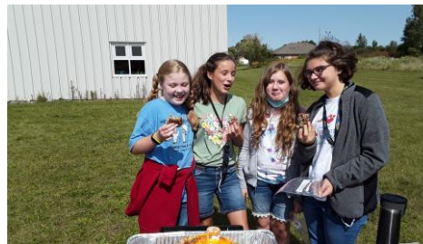
The 6 th grade class is eating one of the volcanos.