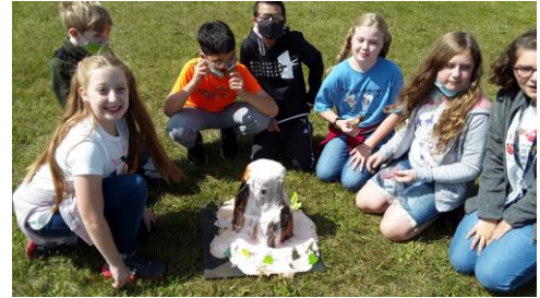
One of the 6 th graders sharing her creation.