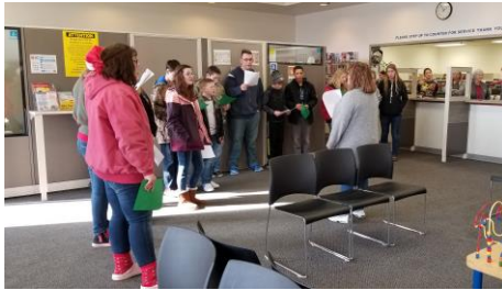
Students Singing Christmas Carols