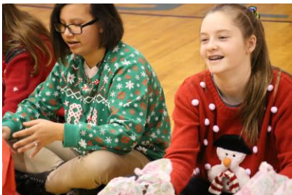
Having Fun Opening Gifts