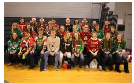
Christmas Sweater Contest