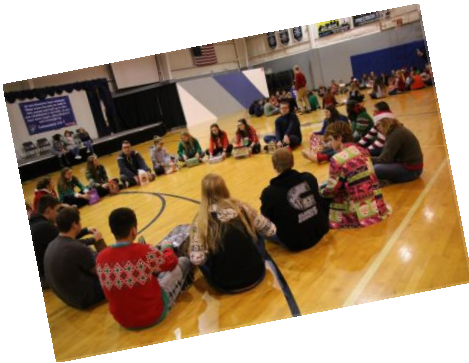
White Elephant Gift Exchange