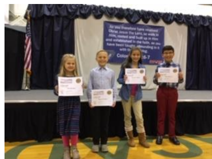
A Honor Roll Students