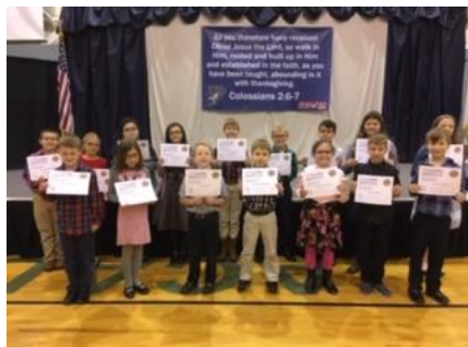
A/B Honor Roll Students