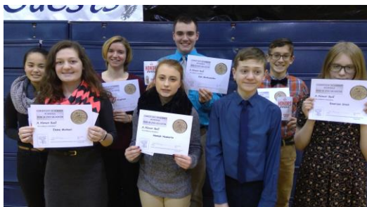
Middle & High School "A" Honor Roll