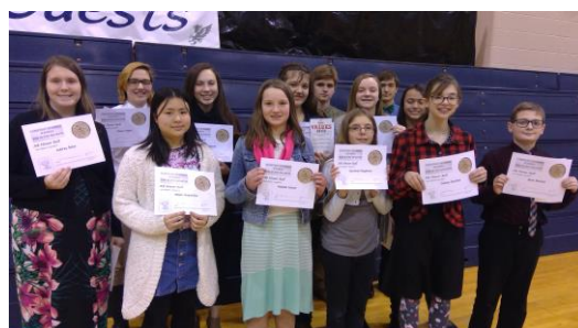
Middle & High School "AB" Honor Roll