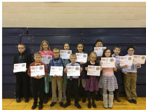
Elementary "AB" Honor Roll