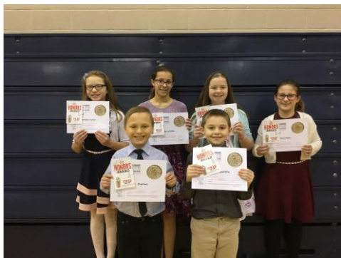
Elementary "A" Honor Roll

Recently all the students grade Kindergarten thru 8th grade made Valentines in art class for "strangers" as part of an outreach activity. We're happy to announce all the Valentines were delivered on Valentine's Day to the Sidney Police Department, Fire Department, Shelby County Sheriff's Department, and the Landings of Sidney (a local senior living community). Nice job everyone!!